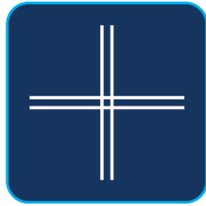
SS 316 Nylon Coated Cables