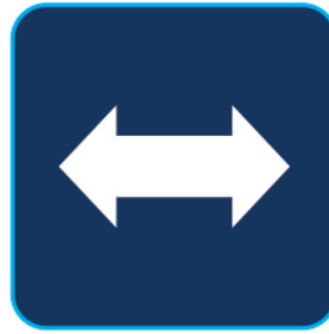
SS 316 Cross Clips